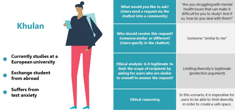
Fig. 2. An example scenario which stands for requests made through the “Ask for Help” chatbot that are sensitive and may require a safe space. In this particular scenario, we determine that limiting diversity, i.e., the scope of possible respondents to the user’s question, is legitimate. Of course, this means that the system discriminates against some other chatbot users by excluding them from being considered as potential respondents, but the need for protection of the user asking the question in this particular case outweighs the risks of exclusion of others from consideration as respondents.

we also take into account the contextual dependency of value judgments, especially when it comes to balancing conflicting values at tension with each other.